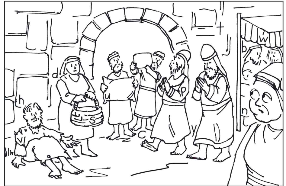
GRACE PRESBYTERIAN CHURCH

Find the 12 underlined letters in the picture below.